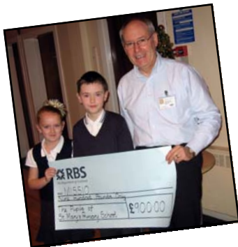
St. Mary's in Paisley gave a BIG cheque.