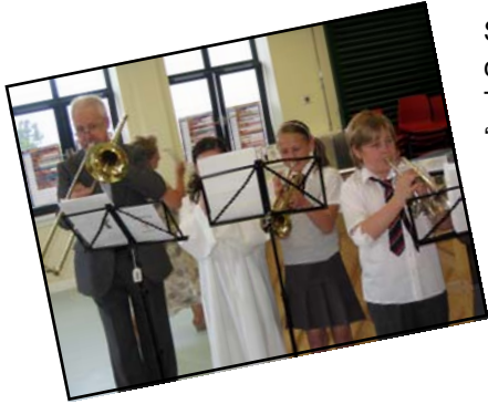
St. Michael's in Port Glasgow celebrated 50 years in style. They also remembered to be 'children helping children'.

The session has been a busy time for schools. No matter what events have arisen the children have remembered the poor children of the world. Here are some examples.