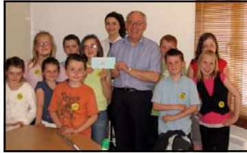
The children's mission group in St. Stephen's parish visited the MISSIO office with their cheque.