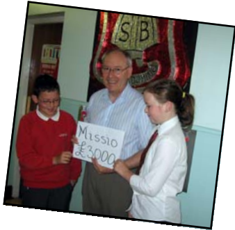
St. Blane's in Blantyre show their mission spirit.