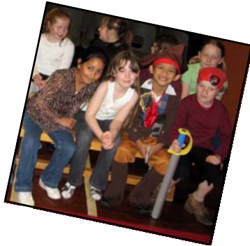
Watch out in Bonnyrigg—there are pirates about!