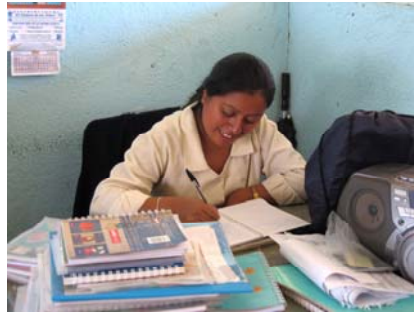
Corrections, corrections ...

Poor families in Ecuador rely on the Church to meet many of their social needs. Access to education and medical care are only possible for a large swathe of the population because of the structures the Church continues to build and support.