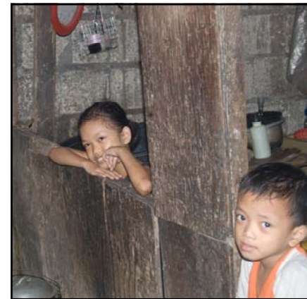
Children living in the Tondo shantytown look out from their simple home.