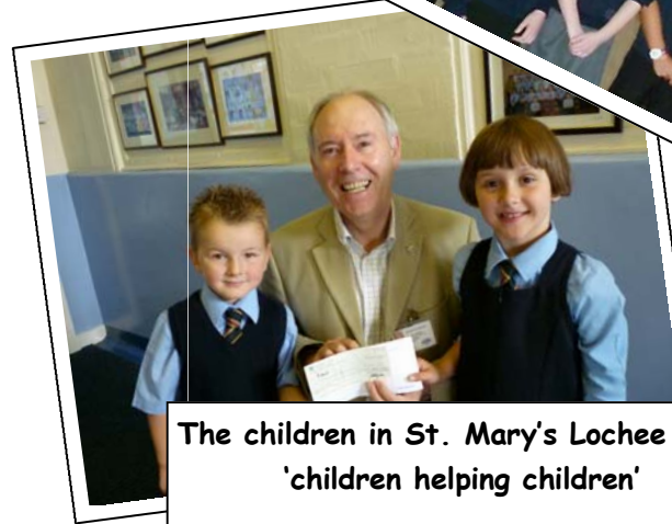
The children in St. Mary's Lochee were 'children helping children'

These are just some of the eighteen schools that had a visit from MISSIO Scotland from September until December 2009.