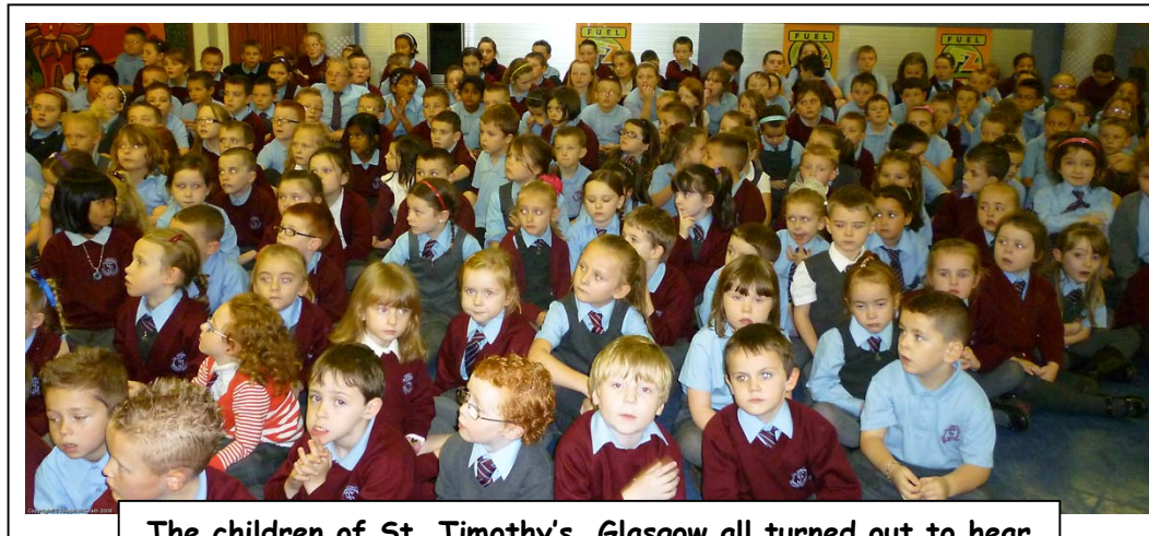
The children of St. Timothy's, Glasgow all turned out to hear about children in Nigeria.

Have your children heard about the poor children in Nigeria? Are they doing their best to share a little and to pray every day?