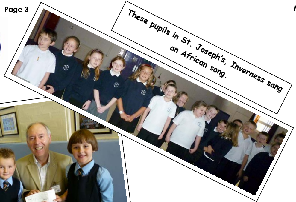
These pupils in St. Joseph's, Inverness sang an African song.