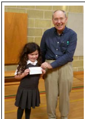
The pupils of St. James' in Paisley gave a big cheque.

These are just some of the eighteen schools that had a visit from MISSIO Scotland from September until December 2009.