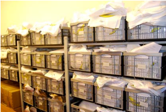
Classroom packs awaiting delivery

This takes a bit of organising, getting up to date with school rolls and class sizes. To cut out unnecessary work we are changing our system this year. In the summer term we will send an e-mail to schools whose e-mail details we have. The e-mail will tell you what we are going to deliver in August.