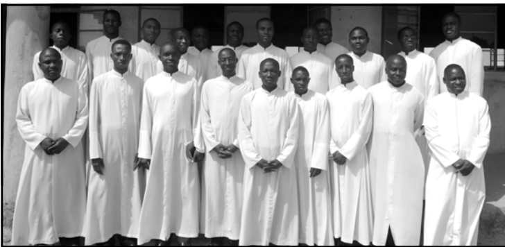
The New Intake at Good Shepherd