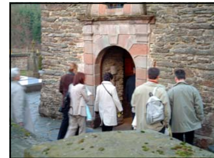
Pilgrims visit the chapel of Rinschladen founded by Saint Willibrord, a Celtic monk who brought the Faith to Luxemburg and Northern Germany.

As we meditate on this third decade, we also bring the peoples of Europe , and their intentions to prayer. Let us also remember the Missionaries working there.